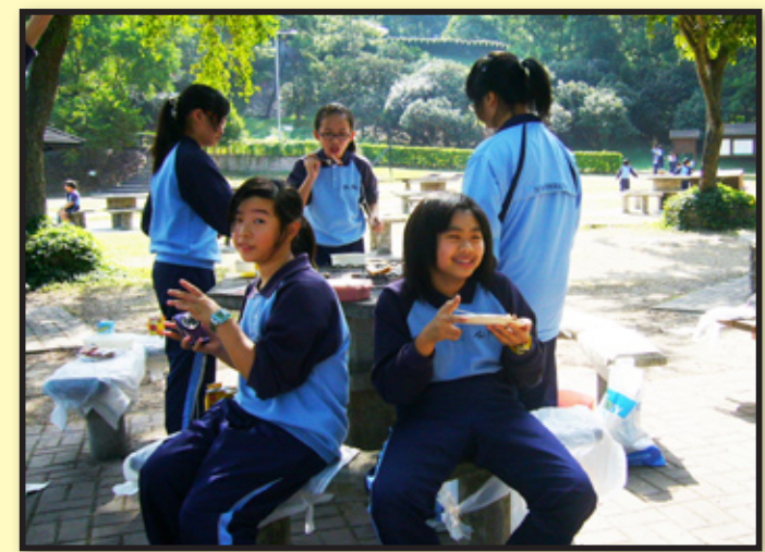
P6 girls enjoying their delicious BBQ!