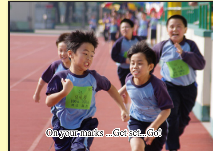
On your marks ... Get set... Go!