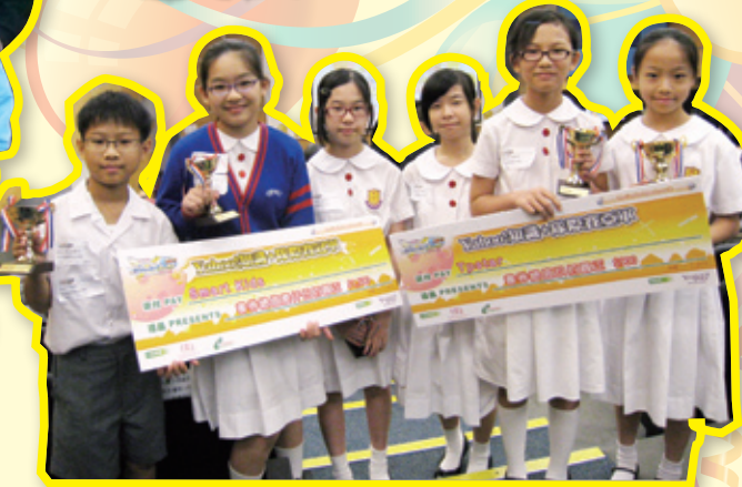
隊際賽成績：Yahoo！知識+隊際賽比賽冠軍及亞軍 個人賽成績：個人賽五年級組 亞軍及季軍 個人賽六年級組 亞軍