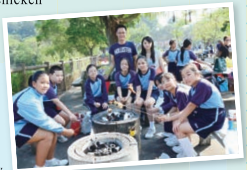
A yummy BBQ!

On Tuesday 13 th November 2012, students from P4, P5 and P6 went to Tai Mei Tuk Country Park for the annual picnic. They went by school bus and it took about 20 minutes to get there. It was a very sunny and warm day. The park was very big. There were lots of trees, picnic tables, a food stall, a playground and some BBQs. The view was very beautiful. We had lots of fun playing badminton, football and basketball. We also ate a lot of food and drank many drinks, for example, potato chips, sausages, sandwiches, chicken wings, orange juice and coke. The headmaster, teachers, students, the school staff and some parents all had so much fun and were very excited. At the end of the picnic we took the school bus back to school. We were very tired, but very happy.