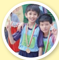
Yeah, we won a medal!