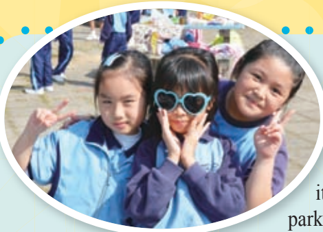
Are we cute?