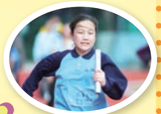
Am I going to win the race?