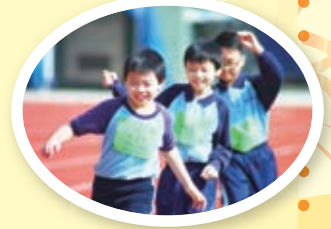
We love Sports Day!