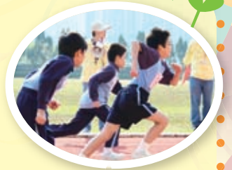
Ready, steady, GO!